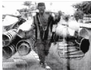
Figure 3 Pikulan is typical male carrying tools.

In bereavement duties for example, women was assigned for one gendhongan and male for one pikulan . Up until now, it is very uncommon for male to carry things with gendhongan , or female to carry things with pikulan . The unisex traditional carrying tool is kronjot , which can be employed by anyone who can ride a bike or motorcycle. Male nowadays prefer to use kronjot than pikulan . Women are still using gendongan as carrying tools. Selendang as tools for nggendhong (carrying), are similar to bags for women in Western culture. Selendang is more likely very close to women, as extension part of her body. Selendang is always lying on her shoulder as empty bag, ready to use for carrying things (Figure 4). Some women used an end of selendang to wrap her money in (Figure 5). Sometimes selendang used to protect her head from sun ray, wind or shower rain (Figure 6).