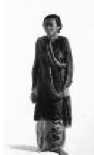
Figure 4 Women with selendang on her shoulder, a painting from Frans Lebet, 1863.