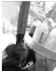
Figure 5 End of selendang to wrap money.