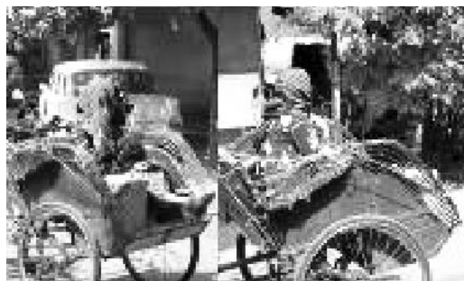
Figure 6 Selendang used for sun, rain and wind protection.