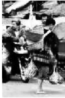
Figure 2 Gendhongan is typical female carrying tools.

In addition, the traditional Javanese culture distinguishes males and females duty based on their social responsibility. The males are responsible of the duties in the social surrounding environment while females are responsible in the domestic areas. This made the carrying products to be different. Gendhongan is typical female carrying tools (Figure 2), and pikulan is typical male carrying tools (Figure 3).